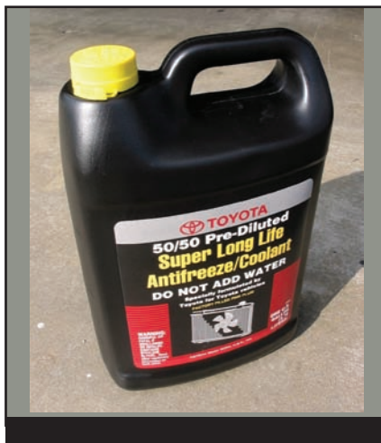
Figure 3: Toyota SLLC pre-mixed coolant is recommended for both engine and hybrid system coolant loops in many Toyota and Lexus hybrids.

Like any cooling system, a hybridrelated coolant loop is subject to regular maintenance. The 2001-2003 Generation 1 Prius uses Toyota's Long Life Coolant (LLC), which must be mixed with water in a 50-50 dilution. All subsequent Toyota hybrids and