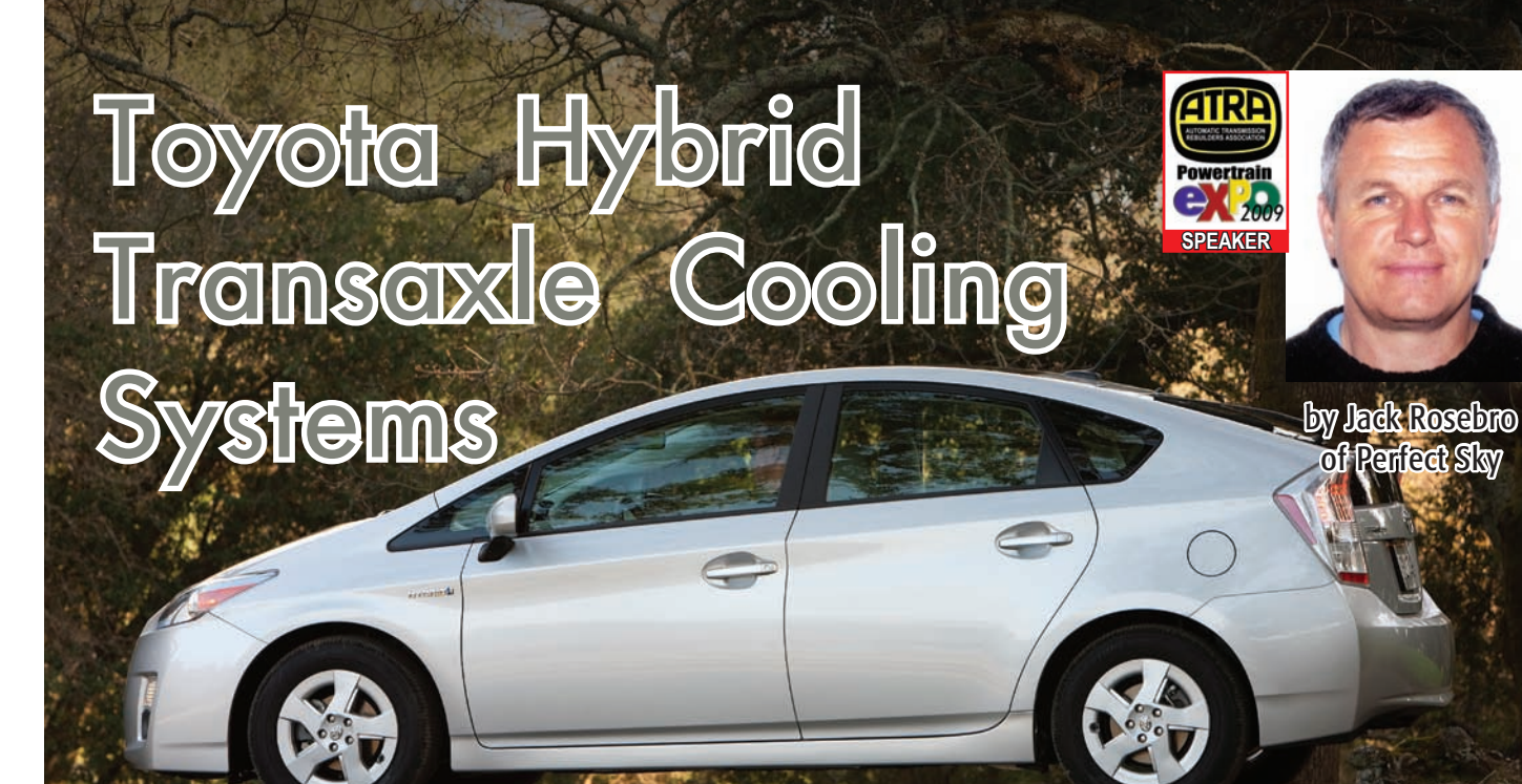
Figure 1: The "Generation III" 2010 Toyota Prius, which arrived in dealer showrooms this May, is one of more than a dozen Toyota and Lexus hybrids which each use two liquid powertrain cooling systems.

oyota hybrids such as the popular Prius-now entering its tenth year and third generation on the North American market (figure 1)—employ series-parallel transaxles and transmissions that house the powertrain's two primary electric motors. Such motors are more properly called "motor-generators", referring to their ability to generate torque (such as, during acceleration, engine-off propulsion, or to start the vehicle's engine) or alternating current (for example, during charging as well as regenerative braking). Motor-generator stator windings can rapidly produce a significant amount of heat, particularly when they are suddenly subjected to high torque demands. While some cooling is achieved by the circulation of air within the transaxle or transmission as well as contact with the transmission fluid that lubricates the unit's bearings. gears, and/or chain, additional cooling is required.